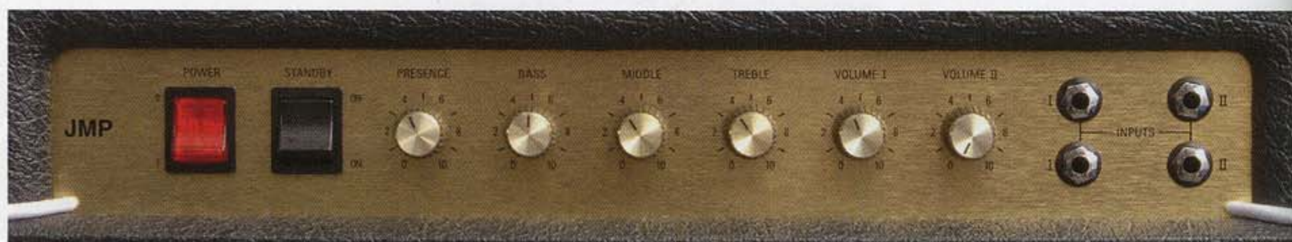
Four inputs offer dual bright or normal options.

This is the real deal, make no mistake. I can only compare it to being a Panzer tank of the bass amp world. The whole system has been very well made and is solidly constructed, the combination of which adds up to a