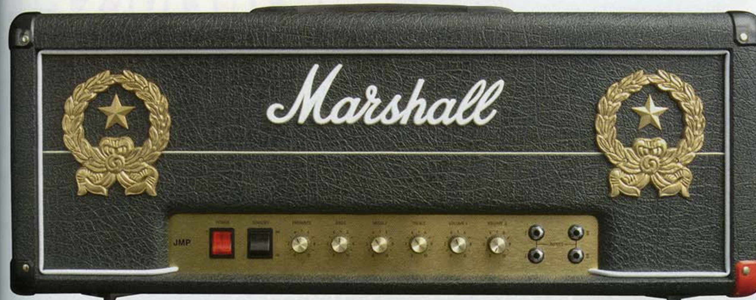
Visuals replicate Lemmy's Murder One original Marshall.

One look at this rig is enough to instil a degree of fear in even the most battle hardened bassist. The thought of four fifteen-inch speakers and an additional four twelve-inch speakers pounding out equal amounts of distorted, snarling bass is certainly not for the faint hearted but it is indicative of the requirements and demands of the player for whom this was put together. Certainly, the whole rig has been built to the usual high standards associated with Marshall gear: immensely robust cabinets, protective sturdy steel grille cover sans cloth, and thick vinyl covering. The cabinet containing the fifteen-inch drivers is especially deep, no doubt to improve the power handling of the unit as a whole especially when you consider the power required to project the bass frequencies emanating from this cab alone, and is capable of delivering 800-watts at 8 ohms. The 4x12 cabinet looks equally adept at performing the task for which it has been chosen and is based on the Marshall Mode Four