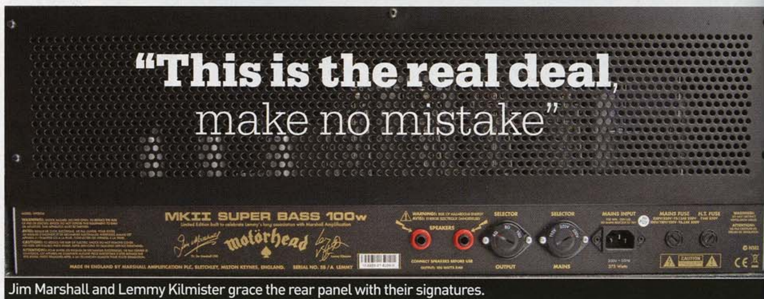
Jim Marshall and Lemmy Kilmister grace the rear panel with their signatures.

very special sound indeed. Leaving one cab out would simply detract from the overall sonic impression. The power of artist association should never be under-estimated and will certainly ensure that this system catches the eye of a number of bassists out there. Nevertheless, there is no denying that it is something of a novelty product - perhaps reinforced by the three Lemmy plectrums and signed certificate that accompanies the amp - with a potentially limited audience and in terms of functionality, I can't see that it has mass appeal. The price is fairly steep, the amp alone costing a snip under £1,400 and transporting those cabs could cause a few headaches not to mention the amount of bass clout produced on stage, which may give sound engineers and bandmates a problem. But irrespective of these