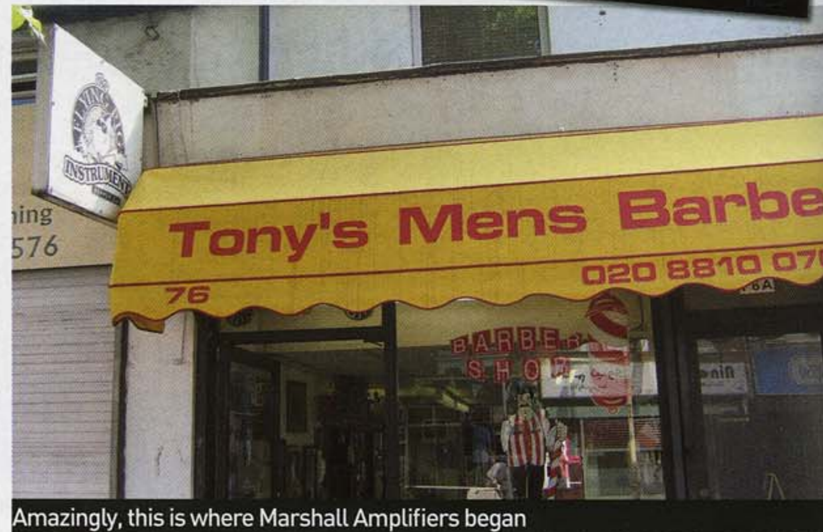
Amazingly, this is where Marshall Amplifiers began