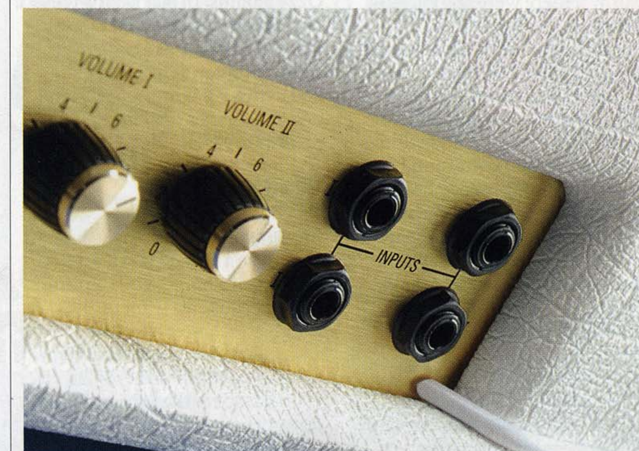
Input/volume I is a stock 1959SLP. Input/volume II has the cascaded gain modification

Having just reviewed the 2203KK Kerry King, was there any thought of including a switch that instantly brings up the classic Rhoads tone as with the KK? "The